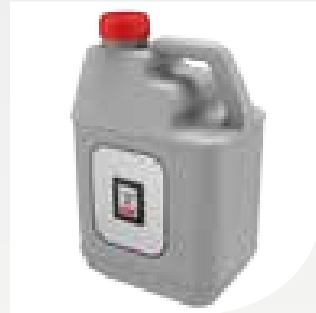
One Side Labeling