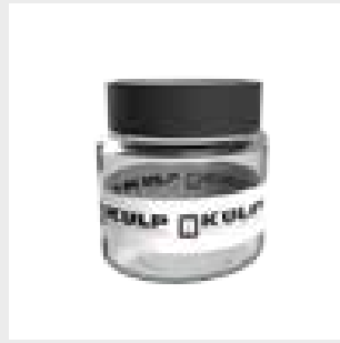
Round / Oval Wrap-Around Labeling