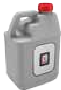
One Side Labeling