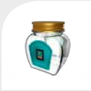
One/Double Sided Labeling