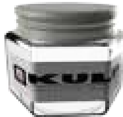
Hexagonal/Square Wrap-Around Labeling