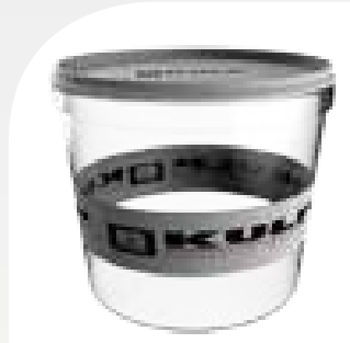
One side /top side labeling