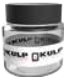
Round / Oval Wrap-Around Labeling